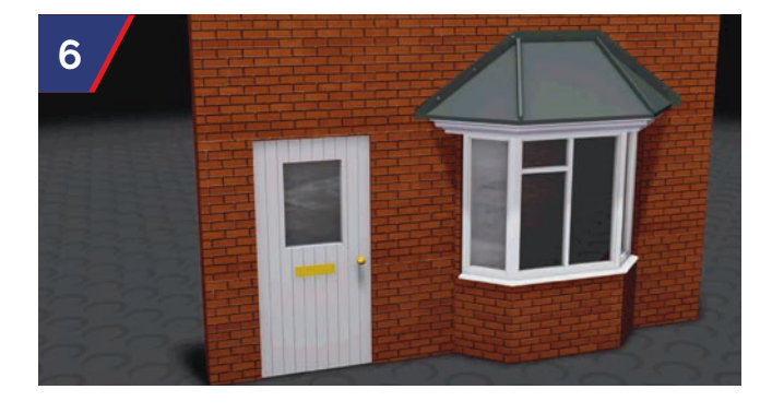
The bay window roof must be over flashed with lead flashing to the Lead Associations recommendations and on exposed sites a bead of sealant/lead adhesive is applied to avoid lifting the flashing.