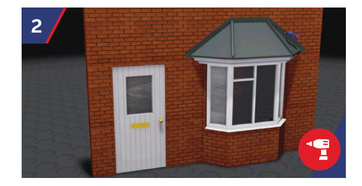
Using a 10mm drill bit, drill through the GRP Upstand into wall structure at a maximum of 450mm centres, to suit the StormFix 80 Fixing.