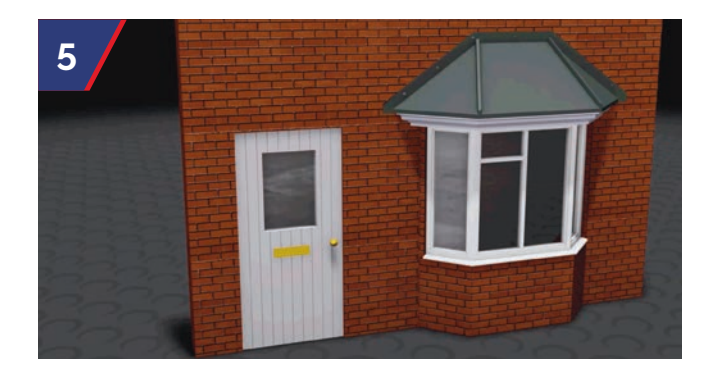
The window head is fixed to the GRP soffit using window manufacturers recommended fixings and sealed with suitable mastic joint.