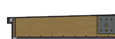
A-A ( 1 : 15 )