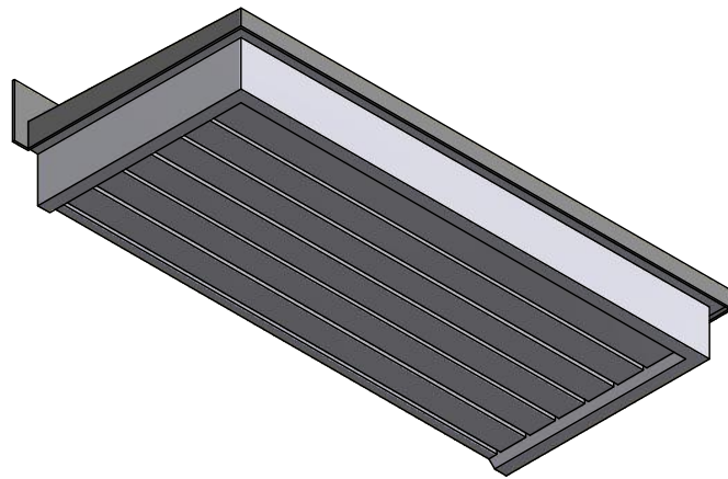
Auxiliary View ( 1 : 15 )