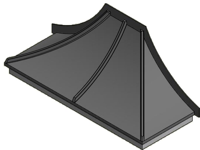
Auxiliary View ( 1:25 )