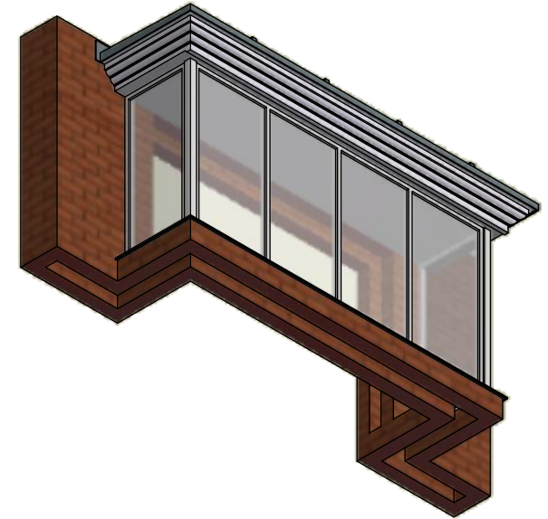
Auxiliary View ( 1 : 40 )